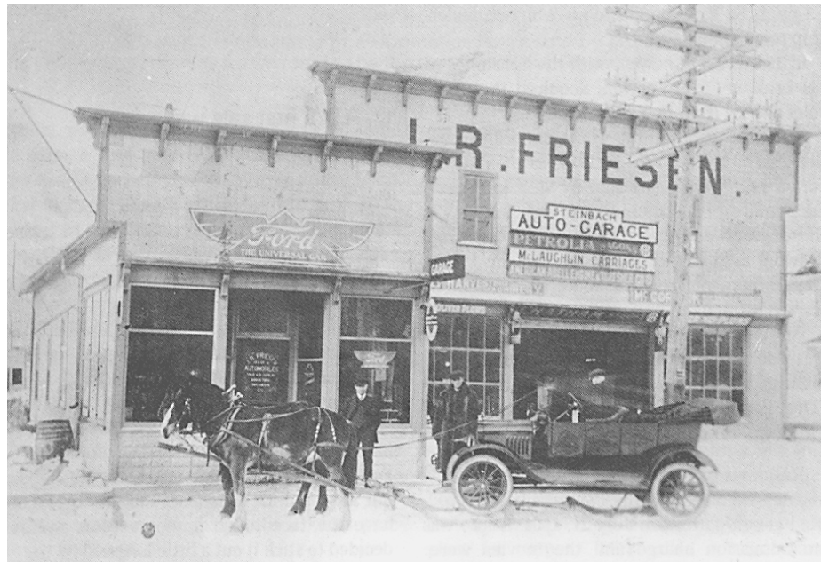
The horses and sleigh "ushering in" the automobile city. (see item 17)

* 13 sites having greatest heritage value.