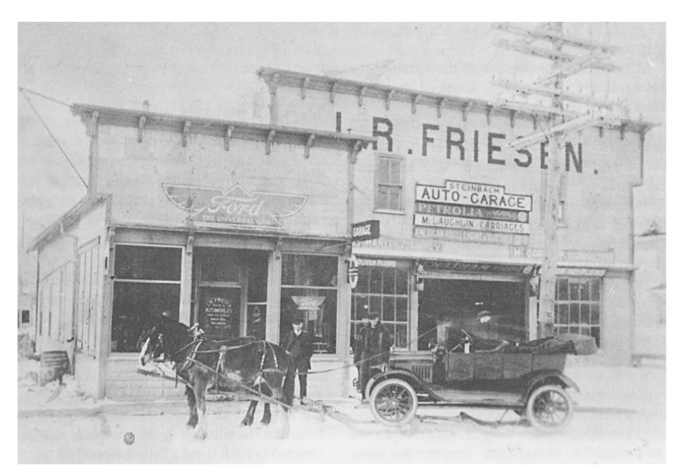
The horses and sleigh "ushering in" the automobile city. (see item 17)